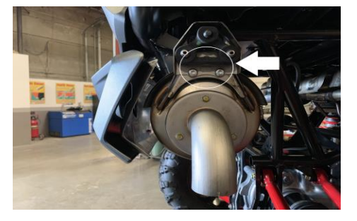
3. Remove the three bolts securing the hanger shield, then remove rubber insulator and then the shield. Next, remove the factory muffler by sliding it off the driver side hanger. Use WD-40 to lube the rubber insulators to aid removal.

2. Remove the two factory bolts with springs from the headpipe and set aside to re-use later. Do not damage the factory exhaust gasket. You will re-use this gasket. Then loosen the O2 sensor and lay it aside for later re-installation.